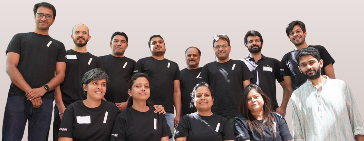
Pragati Cohort bootcamp at The/Nudge, Bengaluru office – February 2025

7. Hon'ble Health Minister in the Indian Parliament, 2024